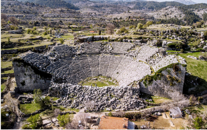
SELGE ANCIENT CITY