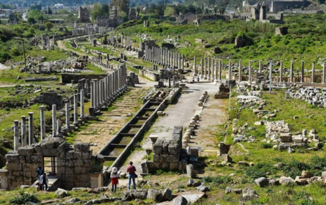
PERGE ANCIENT CITY