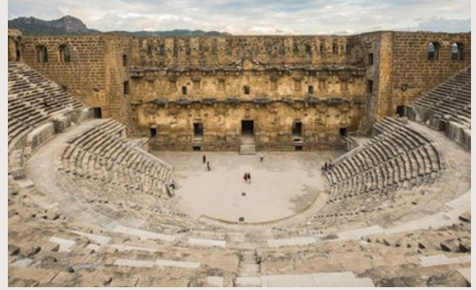
ASPENDOS ANCIENT THEATER LOCATED IN SERİK DISTRICT OF ANTALYA.

The closest ancient city to Sandy Beach Hotel is Side Ancient City. The distance to our hotel is approximately 3.8 km. The distance to Aspendos Ancient City is approximately 32 Km.