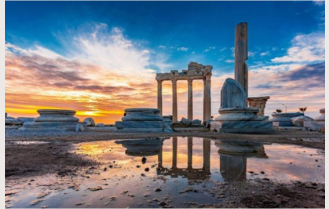
THE TEMPLE OF APOLLO IN SIDE, WHICH IS KNOWN TO HAVE BEEN BUILT AROUND 150 AD.